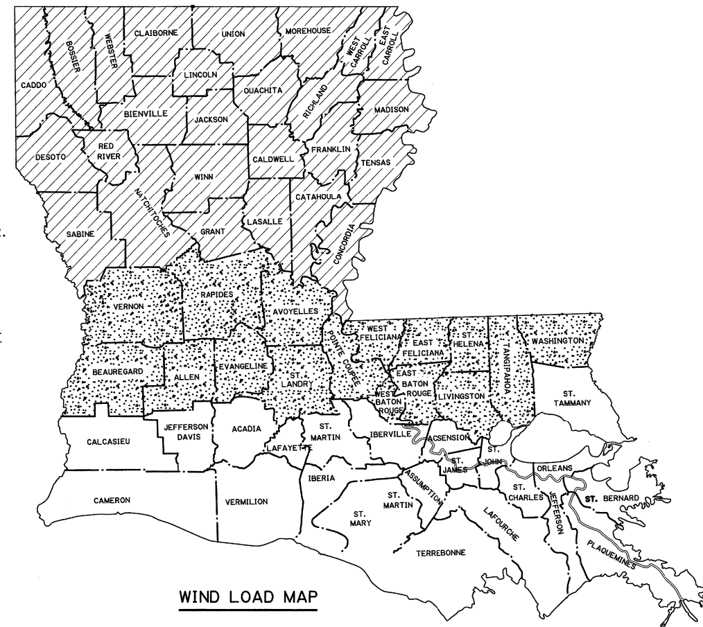
WIND LOAD MAP

GUARD RAIL REQUIREMENTS: A SITE SPECIFIC GUARD RAIL LAYOUT DETAIL SHALL BE PROVIDED FOR EACH GROUND MOUNTED SIGN TRUSS AND CANTILEVER. SEE GUARD RAIL STANDARD PLANS FOR ALL DESIGN CRITERIA AND DETAILS.